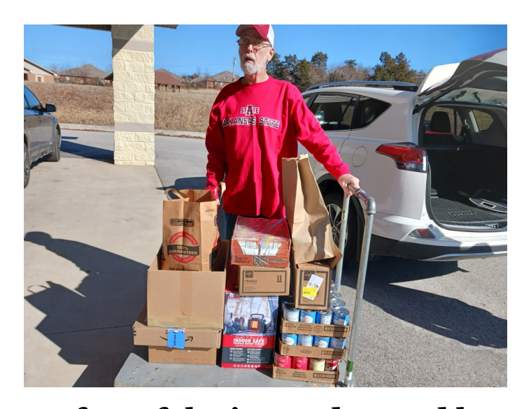
Just a few of the items donated last year.